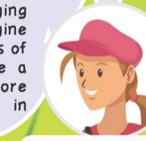
S3 Ashley Lau

Allowing smartphones into classrooms is to offer bullies another outlet for their attacks on other students. With a phone in hand, they may take photos or shoot short videos showing their classmates in embarrassing situations, or they may edit videos of otherwise innocent actions done by their classmates and spread them quickly through instant messaging applications. I can't even start to imagine the damage it can cause to the victims of such bullies. Classrooms should be a safe place for all learners and therefore smartphones should not be allowed in classrooms.