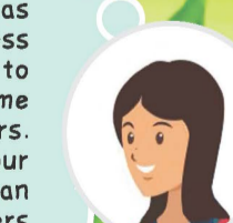
S3 Cherry Lee

Smartphones can be used to cheat in tests and exams. Some naughty students may use their smartphones to look up answers on the internet. Take Maths as an example. They can easily access google or any other search engine to look up answers to the questions. Some even ask someone to text them answers. Why pay attention in class or do your homework and revisions when you can just go online and find all the answers there? As you can see, smartphones are just disruptive and therefore should not be allowed in classrooms.